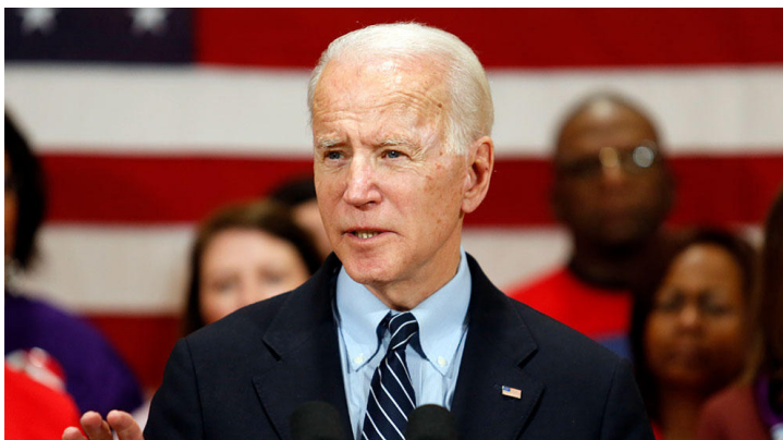
Former Democratic Vice President Joe Biden defeated President Donald Trump to become the 46th president of the United States.

Democratic presidential nominee Joe Biden has defeated President Trump, denying him a second term after a bitter campaign and dramatic, prolonged vote count in battleground states that sparked a flurry of lawsuits. Joseph R. Biden Jr. was elected the 46th president of the United States. After winning the battleground state of Pennsylvania, Mr. Biden defeated President Trump, which put his total Electoral College votes above the 270 he needed to clinch the presidency. “I am honored and humbled by the trust the American people have placed in me and in Vice President-elect Harris,” Biden said in a statement. “In the face of unprecedented obstacles, a record number of Americans voted. Proving once again, that democracy beats deep in the heart of America.”